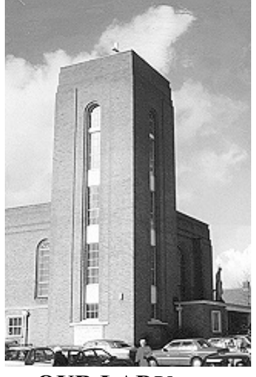
OUR LADY, OUEEN OF APOSTLES